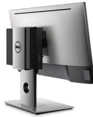
OPTIPLEX MICRO ALL-IN-ONE STAND

Small footprint mounting solution featuring integrated monitor power and Ethernet cables, as well as monitor adjustability with height, tilt, swivel and pivot functions.