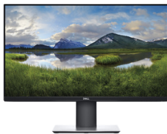
DELL 24 MONITOR - P2419H

23.8" ultrathin bezel optimized for dual display productivity. Easy Arrange feature enables multitasking efficiency and its small base frees valuable workspace.