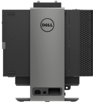
OPTIPLEX SMALL FORM FACTOR ALL-IN-ONE STAND

Small footprint mounting solution featuring integrated monitor power and Ethernet cables, as well as monitor adjustability with height, tilt, swivel and pivot functions.