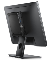
OPTIPLEX MICRO ALL-IN-ONE MOUNT FOR DELL E SERIES MONITORS

Small footprint mounting solution adapts to your environment, with cable management and monitor height adjustability, tilt, swivel and pivot functions.