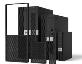
OPTIPLEX DUST FILTERS

Thermally tested custom cable covers offer an easy to install and attractive way to manage cables and secure ports.