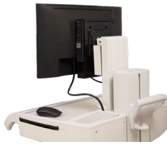
OPTIPLEX MICRO DUAL VESA MOUNT

This mount allows the Micro to be VESA mounted to select Dell E Series displays.