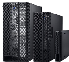
OPTIPLEX CABLE COVERS

Communicate clearly with a headset optimized to provide in-person sound quality, certified for Microsoft Skype for Business.